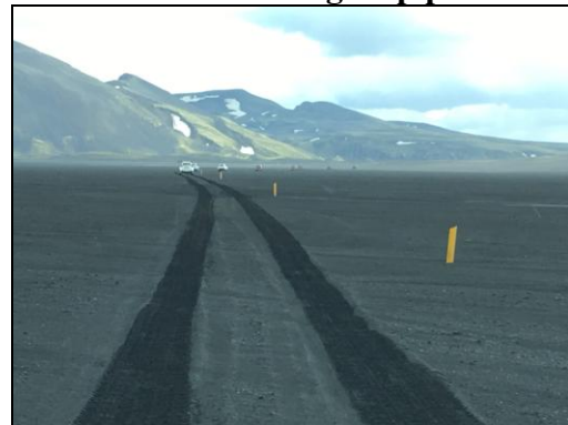
Driving across a black sand desert