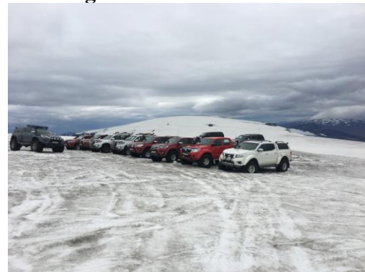
Tyres at 4psi on a glacier