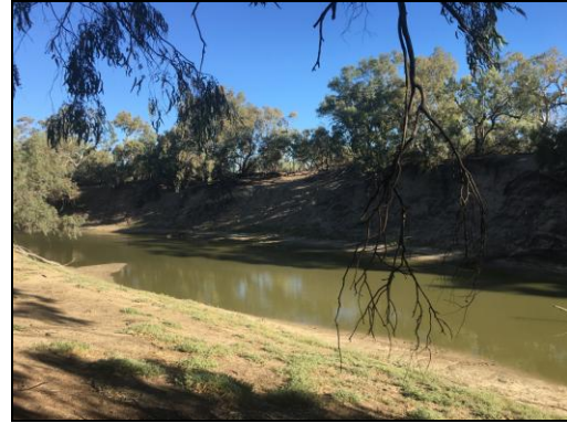
Down the Darling

be leading this trip and I still have 4 spots available. The cost is $6,900 per couple and includes the tour, accommodation each night for 9 nights, dinner and breakfast for two for the 9 days and an evening paddle boat dinner cruise on the Murray.