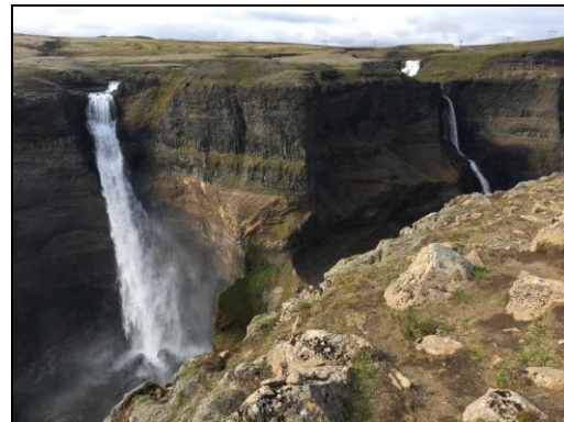
There were lots of waterfalls in Iceland

Right now I've got a group trekking across the rocks to the very tip of Australia and another group catching metre long fish and spotting crocs off West Arnhem Land.