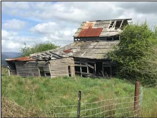
Touring Tassie is full of wonderful sights

My first Tassie trip is fully booked, it commences from 1 November but the good news is I now have a second trip commencing from 22 November, I have 3 vehicles booked on it and can confirm that this trip will be going ahead. I'll be leading this one personally and I'm really looking forward to showing you the best that Tassie has to offer. Actually I'm really excited about the itinerary I have put together as it comprises all the better known tourist attractions along with a lot of the lesser known spots as well as some great 4wd locations. November will be here before we know it, so if you have 19 days to spare please check this one out on my website at http://4wd.net.au/4wd-tours/extended-safaris/touring-tassie-19-days