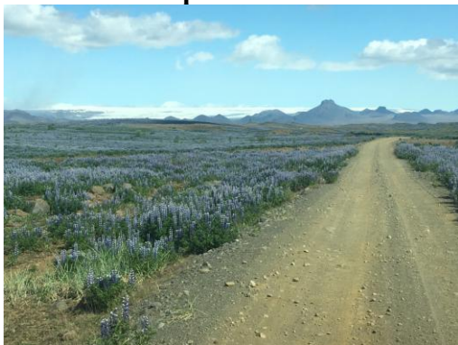
Lupins grow wild in places