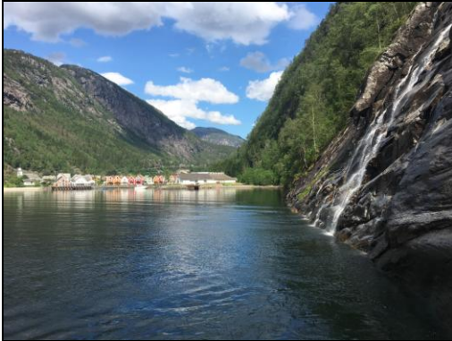
A fjord cruise in Norway

Then we boarded the superb train service that Norway is blessed to have and went from Oslo over the snow capped mountains to Voss for a couple of nights and then onto Bergen in another train. Bergen was equally enjoyable and we walked and took boat rides and caught trams and did all sorts of touristy things, we really enjoyed Norway and want to see more of it.