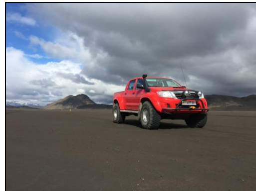
Driving through deserts of black sand

Fortunately, once we picked up our giant Arctic Trucks it was so much better! We spent the next 11 days driving from the left on the wrong side of the road, not that there were a lot of real roads to drive on. The ever changing scenery was literally out of this world, we could have been driving on another planet for all we knew, because this was not Earth as I knew it. Driving across black sand deserts is pretty out there, driving through volcanic ash deserts is up there with it, driving around giant mountains that are in fact remnant volcanoes, which could erupt at any time is plain crazy. Seeing countless waterfalls was stunning, but then driving across frozen glaciers in an Arctic Truck on 38 inch wheels in low range with front and rear diff locks engaged and tyre pressure down to just 4psi, well that is just nuts! Oh, did I mention we walked inside a glacier too!