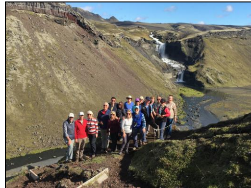
How is that for a group photo!