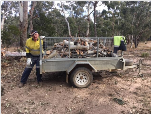
Collecting firewood is an ongoing task at the training centre.

corporate clients. I'm also doing a lot of work on the property, with general cleanups around the grounds, (lots of hard work involved there) installing some new 4wd obstacles and hopefully in a few weeks installing a massive set of solar panels to make us as green as possible. I've also put all my senior trainers and myself through extra training and assessment training, a requirement of offering nationally recognised 4wd training. With Wylie and Brad Bell undergoing the full TAE40116 Training and Assessment course, this is no mean feat either with over 15 days of face to face training followed by hours and hours of homework. I expect they will be fully qualified by the end of September. In the meantime Neill Bell, Bruce Cohen and myself now hold the senior trainer qualifications as above.