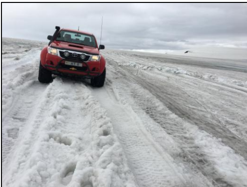
Drive on a Glacier - Tick!