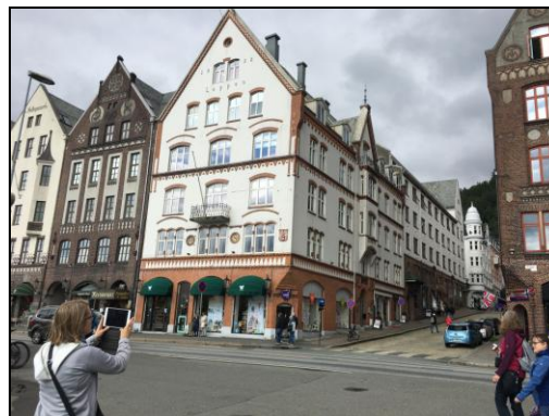
We loved the architecture in Bergen Norway

We were only in Doha for 3 hours, but the size of the airport which needed its own train to get between terminals blew me away. As we took off for another 8 hour flight to Oslo in Norway I stared out of my now window seat at a landscape as depressing as any I have seen. Not a tree or blade of grass to be seen. These middle east countries may be the richest in the world but they chose the worst place in the world to find oil if you ask me.