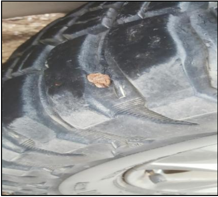
That's a strange way to collect firewood!

enough he had staked a tyre, which was now deflating slowly.