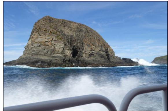
The coast off Bruny Island

Coral Expeditions have a luxurious cruise ship which spends the summer cruising around Tassie and I've got 10 cabins reserved for us. Would you like to join Julie and I on this magnificent 7 day cruise out of Hobart to Bruny Island, then down around the bottom of the island, and then back up to Maria Island before bringing you back to Hobart.