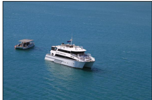
14 days on this luxury boat, life is good

food amazing and I can't think of a single thing not to like about this trip. I have 8 of the 10 cabins filled so we have just 2 twin cabins remaining, see here for the details http://www.greatdividetours.com.au/4wd-tours/extended-safaris/cruise-the-kimberley-coast Don't miss out on this trip, it is a real bucket list item and worth every red cent of the tour fee.