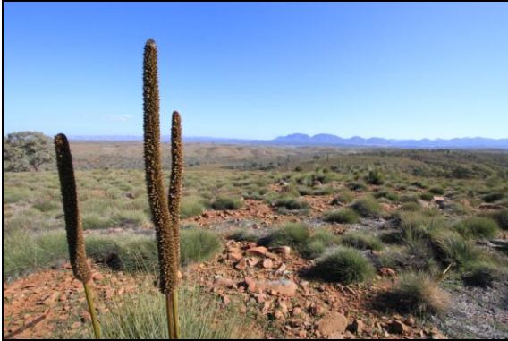
Stunning vistas on our Flinders trip

Fully Accommodated: $7990 for 2 people Camping with Dinner supplied: $5290 Camping only : $3990 I rate the Flinders as good as the High Country so if you have a spare fortnight available think about joining us on this great trip.