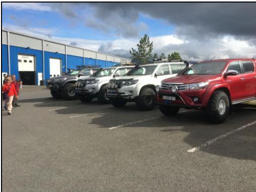
The size of the wheels on our Arctic trucks looked like overkill until we drove on the glacier.

Finally we flew to Iceland and after landing in Reykjavik and taking the 50 minute bus ride from the airport to the city across a lava flow, we were beginning to doubt if this Iceland adventure was a good idea. The scenery between the airport and the city was very drab compared with Norway, even the city was rather dull compared to Oslo and Bergen.