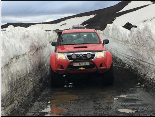
Imagine what its like in Winter!

each flight, that's what I'll be doing next time.