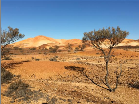
Anna Creek Painted Hills

Adelaide to William Creek and return, accommodation for 2 nights at William Creek plus all meals from arrival to departure at William Creek. I have attached the itinerary to the email with this Newsletter. Let me know if you would like to see the incredible Anna Creek Painted Hills.