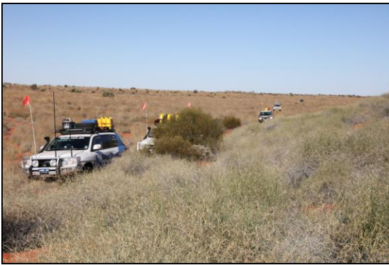
The Colson Track was quote overgrown

We headed straight to Trilby station, where we camped in a great spot overlooking the Darling River, in fact it was so nice under the river gums that we had a leisurely afternoon in camp. It was so peaceful I didn't want to leave the next day. But leave we did and we were lucky to be able to use station tracks through Trilby, visiting their original homestead (Newchum) on our way to Wanaaring.