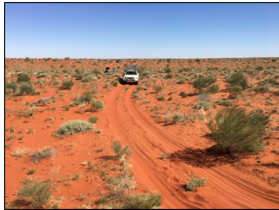
Madigan's 80 th anniversary tour with GDT