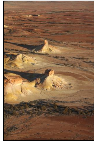
Anna Creek Painted Hills we can take you there first.

From the air the Anna Creek Painted Hills are sensational, and as the light plane circles the Hills you certainly get an awe-inspiring view of the extent of this lunar like landscape. From the air the most striking features are the incredible colours in the hills and of course the weird rock formations standing like sentinels to a lost world. This sight alone is worth the air fare, but once the six seater has landed and you climb out onto the rock strewn landscape you are immediately transported into a world of question marks!