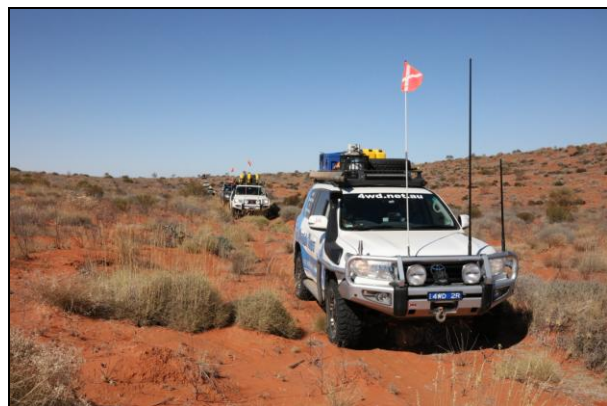
Remote desert travel with great people, doesn't get much better than this