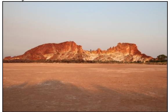
Rainbow Valley, one of many highlights

Whilst I did my quadruple crossing of the Simpson Desert in May I also planned another "Circle" style tour. I'm still very keen to access the Simpson Desert via the Warburton Crossing and hopefully by August 2019 it will have dried out and be open. So my Red Centre Circle tour was born, it will start in Port Augusta and take us up to Marree, then up the Birdsville Track and into the Simpson via Warburton Crossing. When we reach the K1 Line we will follow this delightful track north to Poeppel Corner and then continue north on the Hay River Track all the way to Batton Hill. After a day exploring the local area we will drive down the Plenty Hwy to Alice Springs and amongst other things catch sunset on the beautiful Rainbow Valley.