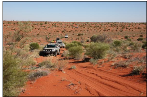
The Madigan Line is the perfect Desert track these days

It was at this point that my original plans had to be changed, I had my heart set on entering the Simpson Desert via the Warburton Crossing, just south of Clifton Hills on the Birdsville Track, but alas 4 days before we reached this point floodwaters that had been coming down the Diamantina River for the past 3 months, crossed the Warburton Track and it flooded immediately and still remains closed today. So when we reached the Birdsville Track we drove north to the famous town and camped that night in brand new cabins all part of the Caravan Park but actually next door to the Hotel where we enjoyed dinner.