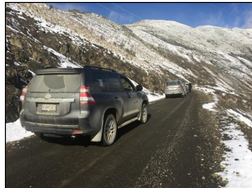
Snow everywhere in NZ, see the last page for more photos of this incredible trip