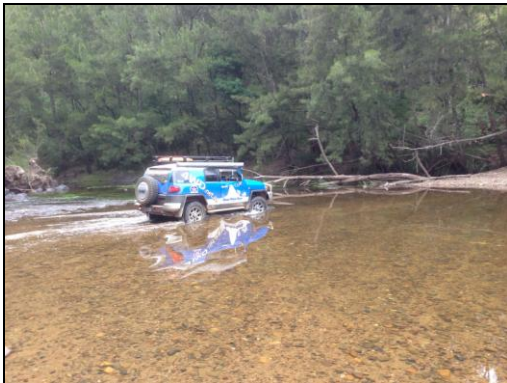
Lots of great river crossings on this trip

Every June long weekend 9-11 June 2018, we run a 3 day trip to one of the best 4wd camping locations in NSW, the beautiful Bendethera Valley on the south coast just inland from Moruya and just 2 hour's drive from Canberra. It is cold in June as you would expect but the base camp for two nights beside the Deua River in the very picturesque valley and the fantastic 4wd action that surrounds the valley helps keep you warm, as will our roaring camp fire each evening. I already have 4 vehicles booked on this great trip being led by Alex, so if you would like to join us for some Winter camping fun, may I suggest you book early as I have a feeling this one is going to be fully booked before too long.