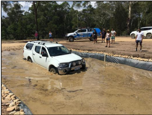
Our permanent water crossing in action

water crossing at my 4wd training centre. With the help of a skilled bobcat driver over 3 days we dug a big hole, measuring 25 metres long by 8 metres wide and over a metre deep. I lined the pool sized hole with heavy duty vinyl and then partially filled it with river rock to simulate a real river bed. Then we waited for it to rain. Despite being another rather dry summer, along with our own bushfire threat, the rain did come and it did fill the water crossing, and now we have a perfect water crossing for everyone to experience during our training.