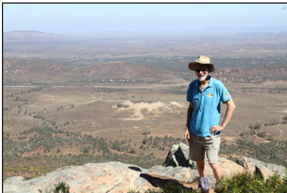
Getting a different perspective on the Flinders Ranges

Finally here is a trip that has a few vacancies and rates in my book as one of the best we offer. It is our Flinders Ranges Wildflower tour, 12 days exploring loads of private station tracks across the Flinders along with a trip to Cameron Corner and finishing underground at White Cliffs, it starts on 31 August and I've got plenty of spots still available.