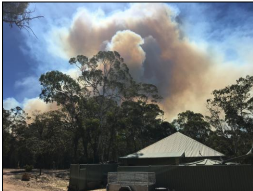
The scene at 2.15pm on Friday

Regular readers of my newsletters will know that about 12 months ago I installed a special fire fighting system on my training centre which, amongst its many features, boasts the fact that it has a superb bush land setting (the training centre not the fire suppression system!)