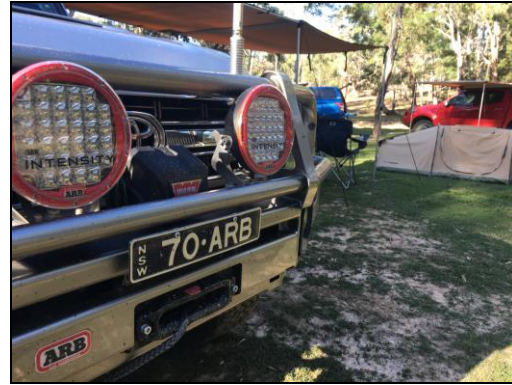
It was a pleasure to host the team from ARB at our training centre a couple of weeks ago

able to take them bush around the training grounds and again demonstrate that no matter how good the gear is that you have on your 4wd, if you don't have the skill to drive in tricky conditions in the first place, it simply won't get you through. The ARB team walked away very impressed with our centre and our method of training.