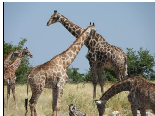
Our African trips are proving to be very popular

I'm pretty keen to take a 4wd trip through Madagascar too and reckon we will get this up and running by 2020.