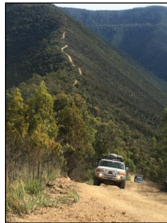
Billy Goat Bluff track is just awesome

In fact, our reputation for running fantastic high country tours saw us being asked by the Isuzu I-Venture Club to run a special 4 day high country trip for them in late March. Neill Bell and I led this one, we even had to drive an Isuzu D-Max, which was quite an experience for me. Needless to say the participants had a ball and we showed them some of the best parts of the high country.