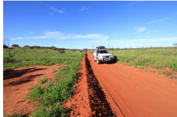
Driving the Anne Beadell Highway into WA

locations, Mt Ive Station and the beautiful salt lake of Lake Gairdner. We then traverse down the equally interesting Googs Track which sees us cross over 100 sand dunes on our way to some of the best beach driving in the country around Ceduna and Fowlers Bay.