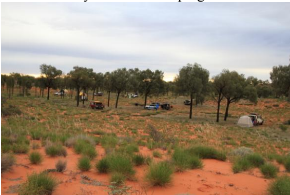
One of Vic's secret camp sites revealed in Unsealed 4x4

Don't forget you can also catch my Camp Site of the Week radio segment on Lifestyle Radio 954AM every Friday afternoon around 3.15pm. I regularly post the podcasts on the GDT Facebook site also. Or download the Lifestyle Radio App to your smart phone and you can tune in every Friday to learn about my favourite camping locations.