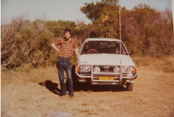
I was 27 years old and about to drive this Subaru to the Jardine River on Cape York.

listicle (new magazine speak for a list article) of my favourite secret camping sites, as if I was going to expose them, "What's that?, You will pay me how much, OK then". Try the link below to access each of them.