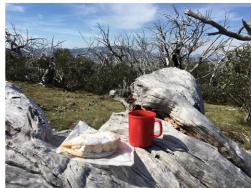
Hard at work in the High Country