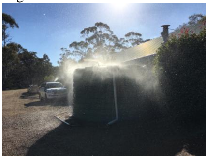
Even the water tanks are protected

The system is fully automatic too, with the ability to self start on detecting excessive smoke or heat. Whilst I feel far more comfortable about the possibility of the centre and those in it surviving a bush fire, I still feel very vulnerable when I walk around the property on these blistering hot days and realise that we would lose all our trees and vegetation, the family of kangaroos that have made Castle View their home and the many birds that wake me up early each morning.