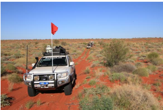
Nothing equals the freedom of the wide open desert

We are following just two wheel tracks and due to the lack of traffic it does not suffer from the corrugations and moguls that are commonly found elsewhere in the desert making this a an enjoyable 4wd experience. After the 10 day desert crossing, we don't rush it, we also track down through Innamincka and Cameron Corner rounding off a fantastic outback experience. This trip is taking place from 14-30 June 2017 . This trip has just one booking thus far and we do need 4 to be able to make it happen, this may be the last year we run it too for a while so please consider joining us. I can send you the detailed itinerary also if you wish.