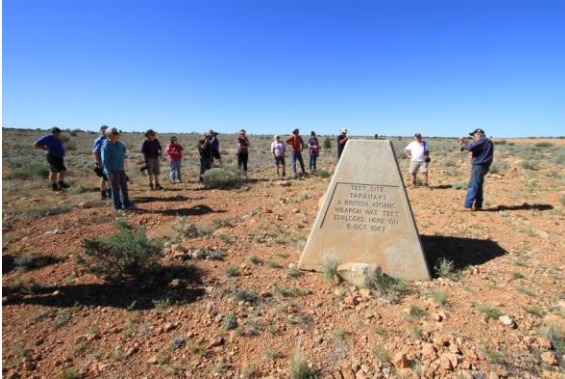
We have a local guide who was there during the testing etc to guide us around Maralinga

known and most likely on everyone's bucket list for outback travel. But let me share with you why two of my best outback trips should also join this list.