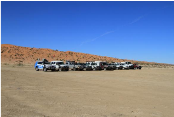
I'll be taking the charity drive over Big Red

Prostate Cancer is another hideous cancer that affects more men than will let on. The idea for this, the first of what we hope will be an annual event, is to raise at least $30,000 for the Prostate Cancer Foundation of Australia. My role, apart from lending my name to support the event, includes designing the rally route, accompanying the rally and providing as much media as I can through my various networks. I would also like to think I might be able to convince some of you to join us on this fun filled event and perhaps find some sponsors that would also donate some badly needed cash to help raise our donation above our goal.