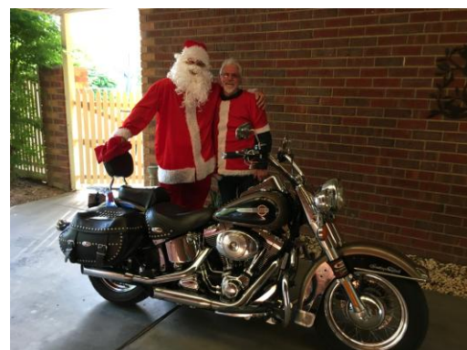
Santa warming up for our snow tour