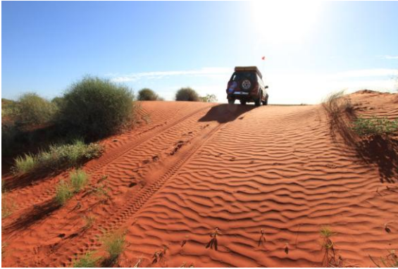
The sand dunes along the Madigan Line are amongst the best I have seen

station to Birdsville. It does travel through very remote country, in fact I personally think it is now more enjoyable than the traditional crossings on the Simpson Desert via the French Line etc.