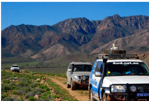
The Flinders Ranges tour in September is designed to catch the best of the wild flowers.

16-24 September the 3 rd Outback Icons trip has 2 spots available.