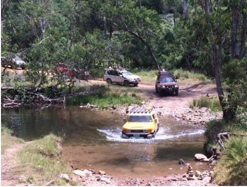
Tony's high country convoy

In the meantime Dave was leading our 7 day High Country camper trailer trip between Christmas and New year and he experienced some rather heavy rain whilst down in Talbotville. So much so that he had to make the decision to move camp as it was expected that the Crooked River would break its banks and possibly flood where the group was camped. It's always a difficult decision to ask everyone to move camp once they have settled in for few days and become somewhat established in the one spot. But the word we received from the Ranger in Dargo was that over 100mm of rain had fallen in the catchment of the Crooked River and previously that meant a rather severe flood would wash down the valley. Well, you guessed it, Dave asked everyone to move to higher ground and the river remained at a low level, nothing wrong with being over cautious, just imagine if we had ignored the advice and had our gear washed away!