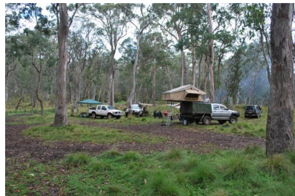
Camping in Barrington Tops is magic