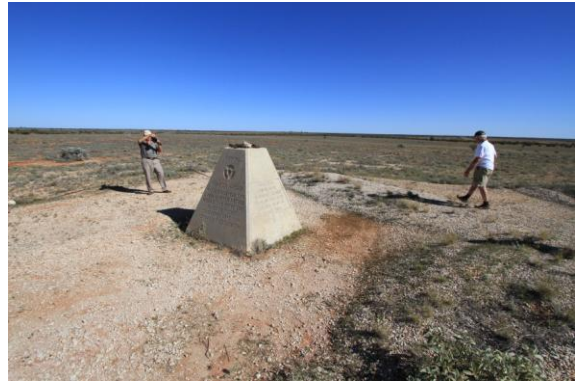
You wouldn't want to have been here on 22 October 1956 Atomic bomb test site at Maralinga