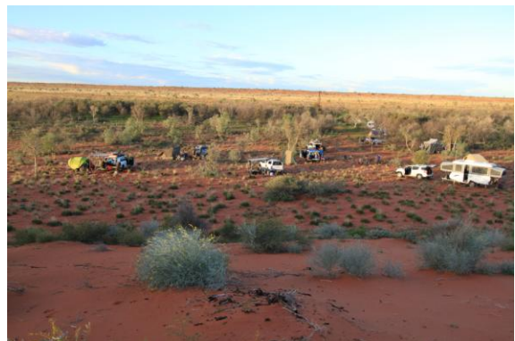
Our bush camp near Arrabury