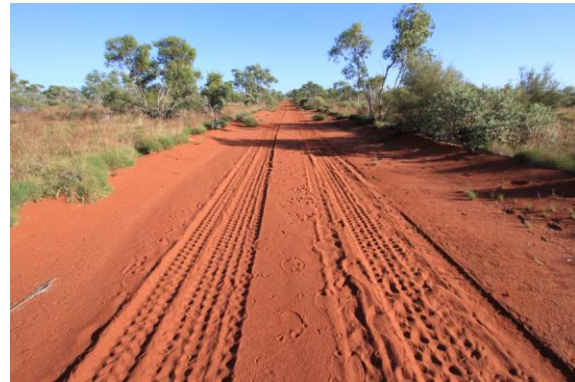
The Anne Beadell Hwy

Here are some photos from my Maralinga Trip, it was close to one of the best trips I have ever done, so we have added it to our 2017 calendar and have bookings for it already.