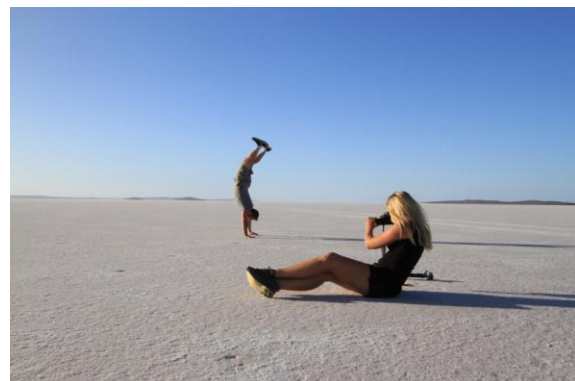
The things you see on Lake Gairdner