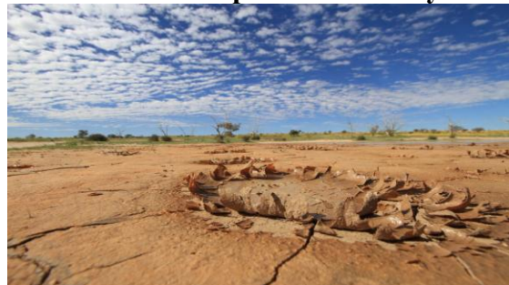
Dried puddles in the desert