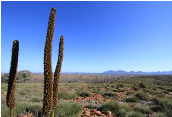
The scenery in the Flinders Ranges is as good as it gets

4wd trip in the country. We visit no less than 7 private stations to utilise their 4wd tracks including the amazing Skytrek, Merna Morna and Alpana station tracks, We also include a visit to Arkaroola and you have the chance to do the Ridge Top tour. After exploring the length and breadth of the Ranges we lead you up the Strzelecki Track to Merty Merty and onto Cameron Corner and then through Sturt National Park for our final night at the impeccable White Cliffs Underground Motel. I have a few spots available so if you wish to see the outback like it is rarely seen, with all the wild flowers, drop me an email to receive the detailed day by day itinerary.