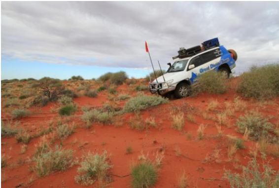
You guessed it, still driving east