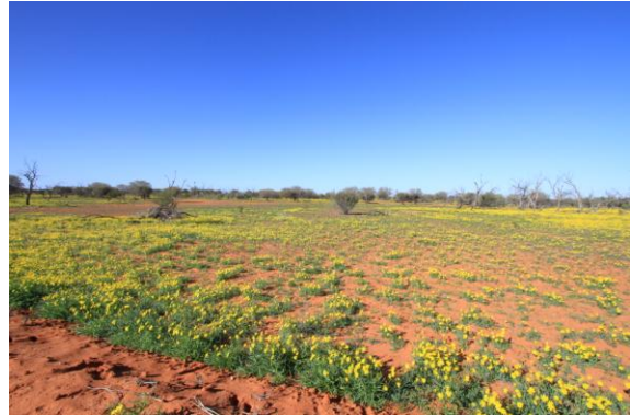
The wildflowers were amazing near Cameron Corner

This year's trip was almost washed out with rain falling the week before the concert and flooding the camp site, this necessitated the concert being moved to the sports oval in Birdsville. With a stroke of luck I managed to book our group 10 camp sites in the Birdsville Caravan Park for the 4 nights of the concert making for a very comfortable concert experience indeed, see the photos following for a pictorial of the trip.