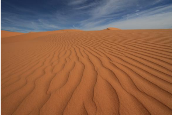
One of the best red sand dunes in Australia, and we know where it is