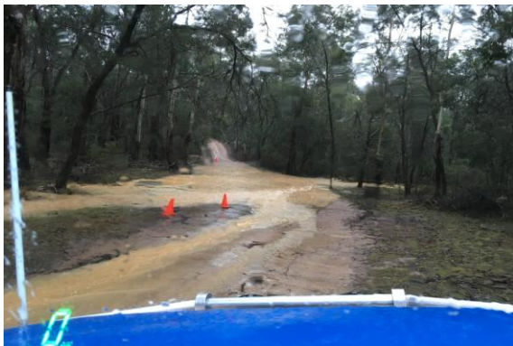
The flooded entrance to Castle View in June

We've also had a heap of rain down at Braidwood, in fact we managed 6 inches in one 24 hour period and had several rivers running through the property, we even postponed one course because it was just too deep in water to conduct the training. And we've had a few trees down with the high winds but lets look on the bright side, we've now got plenty of firewood. I have noticed that my local wildlife population has exploded with wombats and kangaroos visiting the grounds every day, even the frogs are having a croaking good time in our dam, makes it hard to sleep at night with all the nocturnal activity going on!