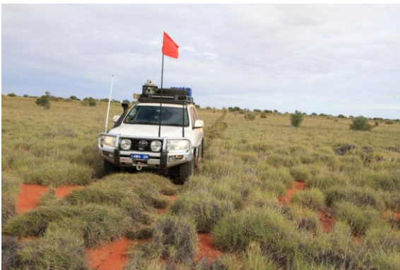
Driving east through spinifex