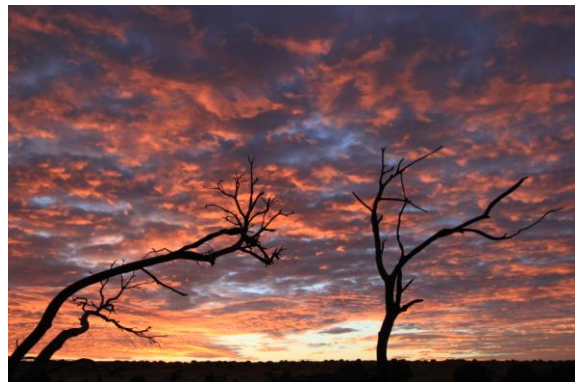
The sun rising in the east