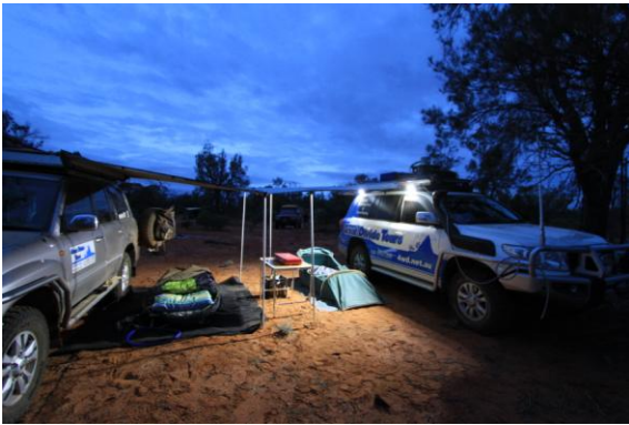
Camp on Googs Track