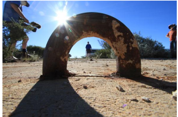
Hook used to tie down the bomb