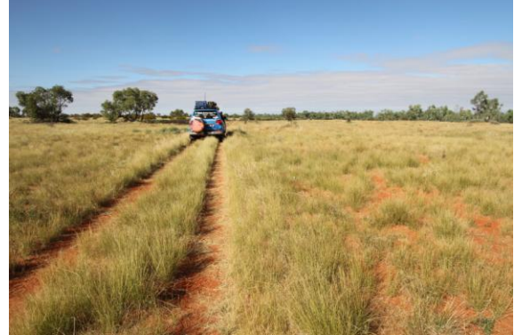
The Hay river track

the Bookie family to the Queensland border. This was a true off road adventure and I have to go on record and say what an amazing job Ian Bragg did with our navigation and track blazing over those two days, check out some of the photos from this epic adventure.