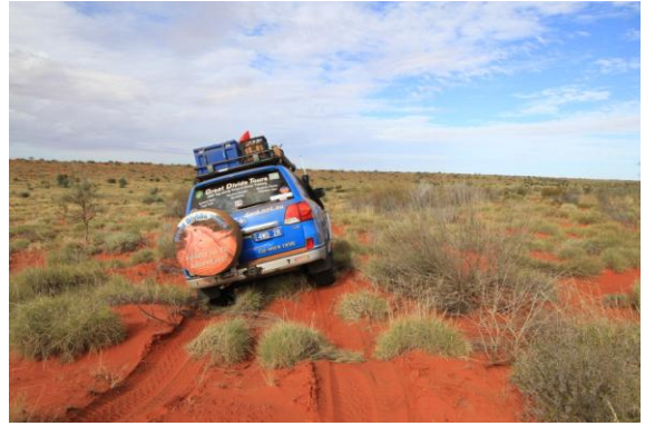
Rocking and rolling as I drove east