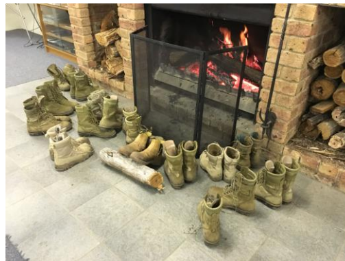
ADF boot camp!

Despite being away for about 7 weeks over the past 3 months, it seems like I haven't been home at all, well I haven't, as I've been down at the training centre delivering more training. We have had several corporate groups visit us from the ADF & AFP, Essential Energy and even the Bureau of Stats (don't mention the census!) Plus we have had our usual weekend courses and of late a lot of individual 4wd training, imagine being stuck with me all on your own for a day or two of full on training. Great value for money and a great way to really learn the ins and outs of your own vehicle, I have to admit though that after two solid days of instructing my old voice box does get a bit croaky, I even surprise myself as to how much I can talk!