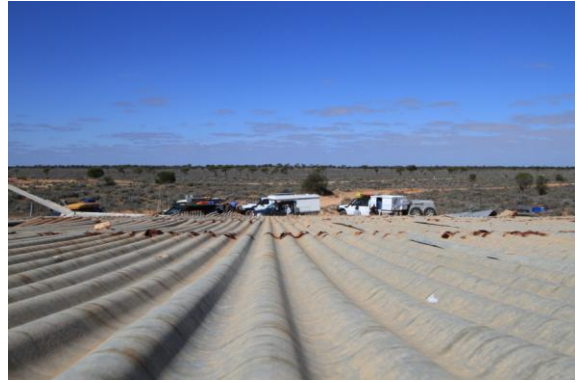
Gotta Luv corrugated iron