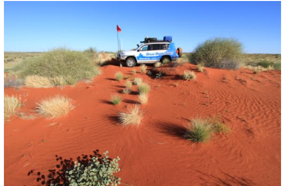
Red dunes as we drove east