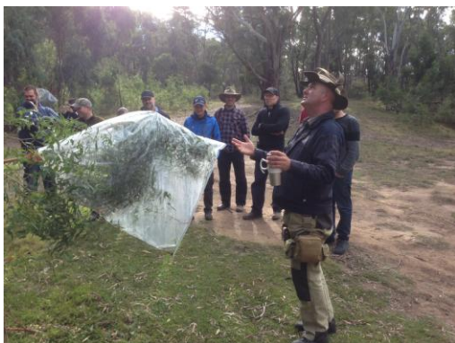
If all else fails pray for water