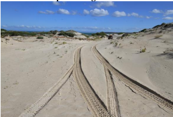
Beach driving near Ceduna