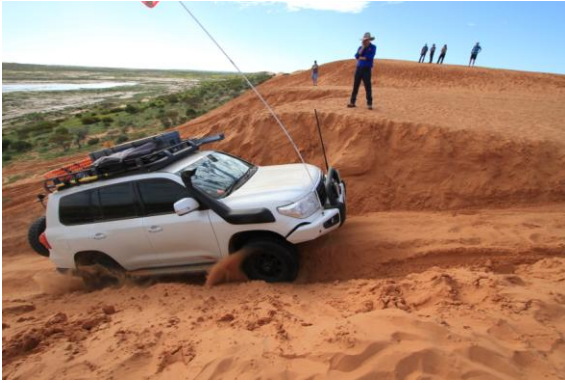
Making it over Big Red