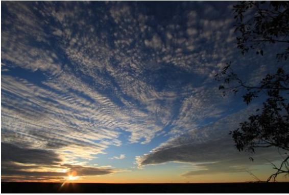
Sunset on the Anne Beadell Hwy