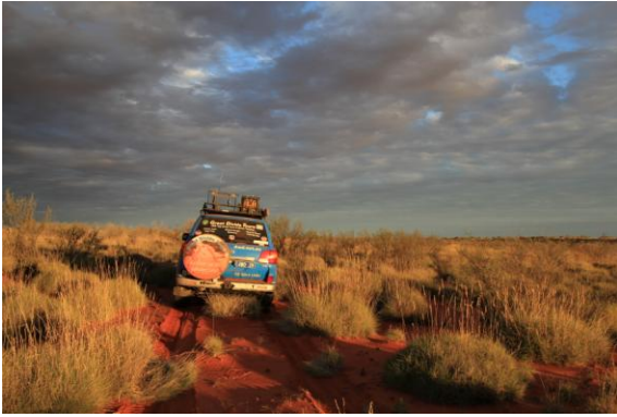
Driving East again