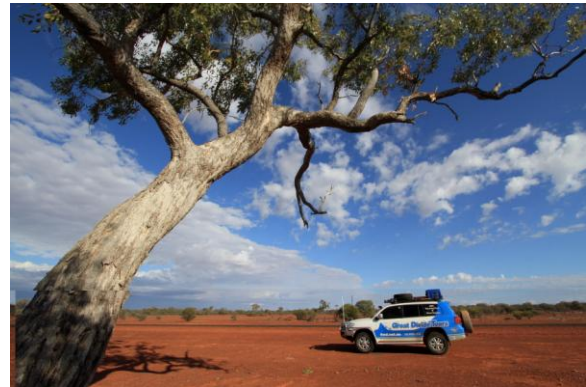
The outback is stunning

I then headed south in the afternoon towards Boulia where I had booked a room for the night, the last few hours of the drive was in the later afternoon light and the colours of the outback were outstanding and even though I was all on my own in a very desolate location it was absolutely beautiful, a drive I will remember for a long time.