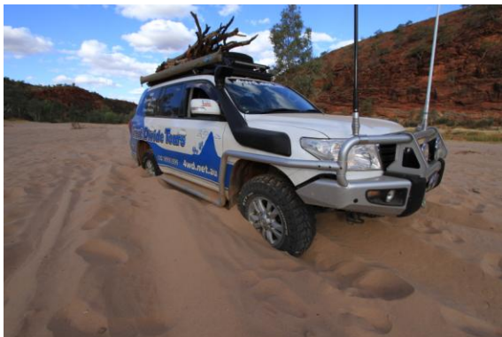
Bogged? No, not me!!

For those of you following this saga, I have stuck with the Ultimate/Lovell springs suspension set up and it is performing well, it went really well on my trip out to the Red Centre. Finally the fuel economy is starting to improve too, I saw a mid 14's on the Red Centre trip, my best yet. I have clocked up 40,000 k's now so the engine is starting to settle in I think. I have learnt to always carry a spare fuel filter or two though and know how to change it, there is a lot of dirty fuel out there.