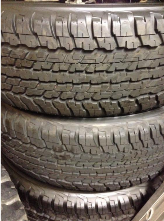
Five of these brand new tyres for Christmas and they are free!

I've tried to sell them and had no takers so here they are FREE, 5 tyres off my FJ Cruiser, original equipment Grantreks in HT pattern 265/70/17 Free to anyone who can pick them up. Call me on 02 99131395