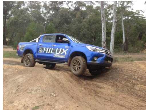
The new Hilux was very impressive

deactivated when the rear diff lock is engaged, a retrograde step if you ask me.