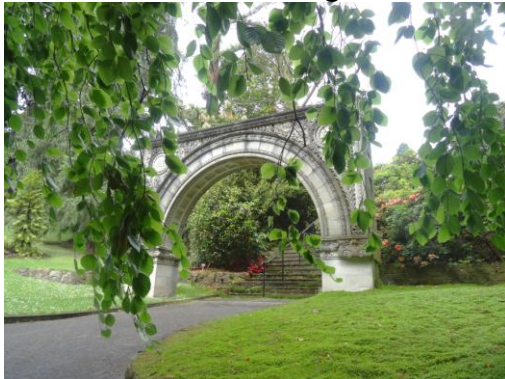
Hobart Botanic Gardens

We only had 9 days in Tassie but made the most of it with the 3 day Bay of Fires walk, a driving tour through central Tassie, 3 days on Bruny Island and finishing off with the Salamanca Markets and a stroll through the beautiful Hobart botanic gardens.