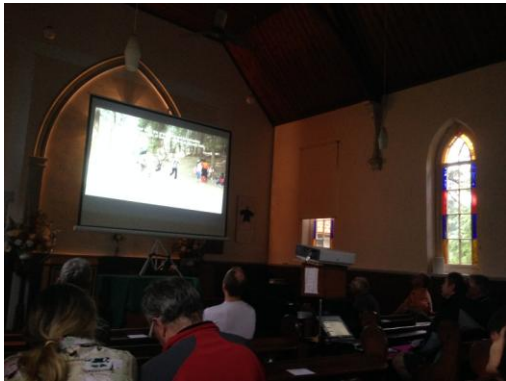
The film festival is a must for anyone with the spirit of adventure and travel

Bright in Victoria hosts the Adventure Film Festival each year in mid February. Next year's festival will be held from 12-14 February. I attended it this year and found the various short films and presentations by adventurers to be inspiring and exciting. I'll be going down to Bright again in 2016 and this year I have been invited to present our film that we shot whilst completing the first crossing of the Simpson Desert in its 50 th anniversary year of the first motor vehicle crossing. If you would like to attend the festival check out their website, you won't be disappointed. http://www.adventuretravelfilmfestival.com/australian-festival/added-attractions/