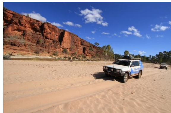
The drive along the Finke Gorge is one of the best

Or you might like to purchase one of my books or DVD's, we now have our latest DVD on our Madigan Line crossing as well as our New Zealand tour, the First Across the Desert and the epic Burke and Wills trip from 2010. You can combine any of my books "Classic Outback Tracks", "Travelling the Outback" or the "4WD skills manual" with a DVD of your choice too. Prices start from just $20 plus postage.