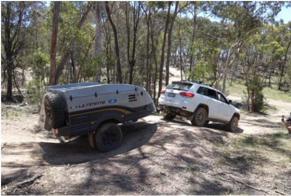
One of the best off road trailers money can buy

Campers based in Moruya attend the training centre for a couple of days of 4wd training with their 4wd drives and with a brand new Xterra Ultimate Camper in tow. This gave the people who build these great campers the chance to see them in action and see what we teach people who own off road campers, why invest $50,000+ in a camper and then not invest in how to tow it off road?