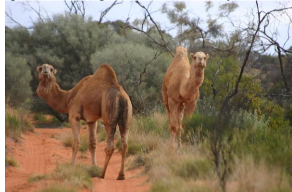
And we will see plenty of these

beaches around Ceduna and Fowlers Bay, then after the bomb sites we will drive the length of the Anne Beadell Hwy and back up to Surveyor Generals Corner (WA/SA/NT) then along the Sandy Blight Junction road, then down to the Finke River (one of my favourite outback locations), Rainbow Valley and finishing in Alice springs. This trip will take place in May 2016 and I have a few spots remaining on it if it interests you.