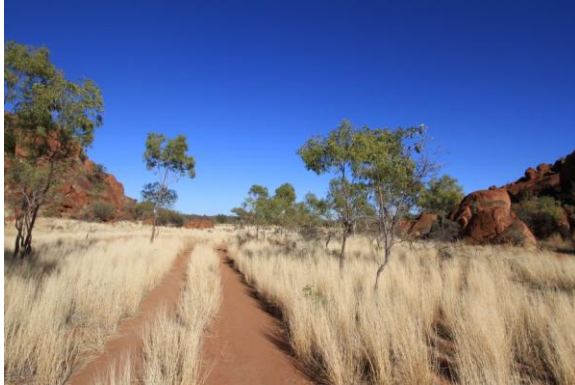
The road to Tower Rock on the Binns Track

around the camp fire from that incredible experience. The race was won by Andrew Cowan in a works Ralliart team Pajero.