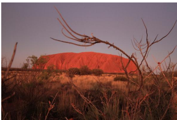
Sunset at the Rock

We had a very successful outback touring season which many of you participated in. Some great feedback from our customers for all of my guides too.