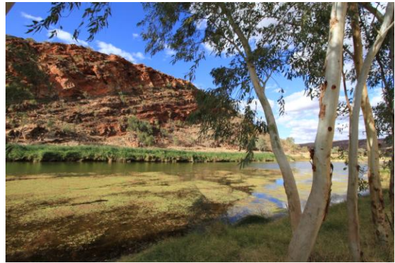
Scenes from my adventures this year