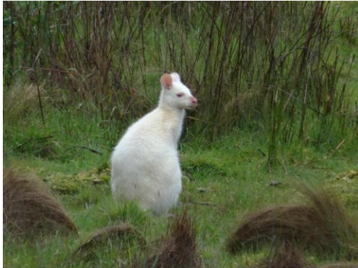
Yes, its real

100 of these playful creatures. What intrigued me about Bruny Island was its supposed population of white or albino Wallabies, they appear in the brochures on the island but I didn't really expect to see any, but we did. One wet afternoon whilst out touring, we spotted a white wallaby in the distance, fascinating!